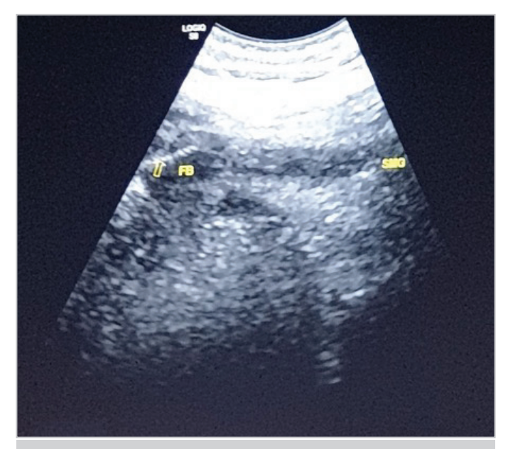
Figure 5. Linear echogenic foreign body (yellow arrow) in the left submandibular space, approximately 1.4 cm anterior to the submandibular gland (labeled as SMG) and embedded in the left mylohyoid muscle

Lateral neck radiography enables early detection, is costeffective, and provides 90.6% diagnostic accuracy in the presence of both radiopaque density and air column lucency. Increased prevertebral thickness of more than 20 mm at the C6 level is indicated as an alarming finding (3).