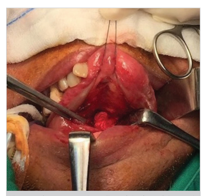
Figure 2. An incision at the midline of the floor of the mouth slightly extended onto the ventral surface of the tongue. The tongue was sutured with silk and retracted superiorly

good recovery with good FOM (floor of the mouth) wound healing.