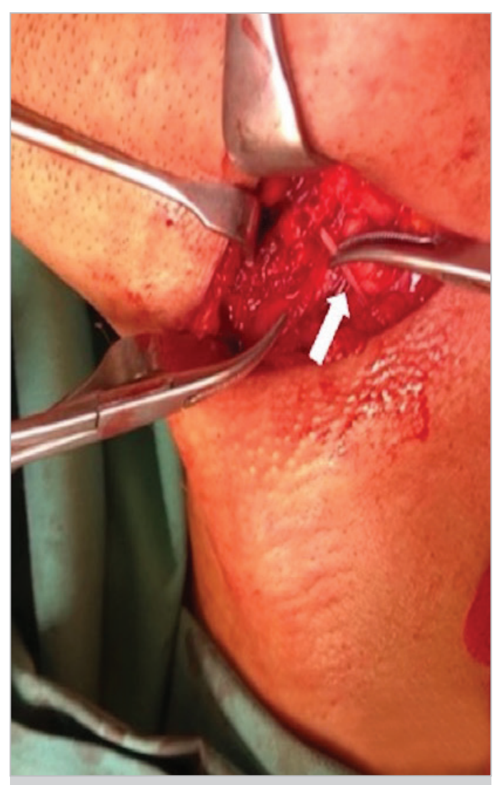
Figure 6. Linear fishbone embedded in the left mylohyoid bone (white arrow) was successfully removed

Ultrasound offers the advantage of soft tissue foreign body detection and an increased ability in identifying radiolucent foreign bodies (5). It is recommended in detecting the location of a migrating fishbone as reported in the case of a rapid migration within 48 hours (2). Intraoperative ultrasound provides a dynamic assessment of fishbone location during operation. The migration is assisted by the physiologic movement of the neck muscles, horizontal