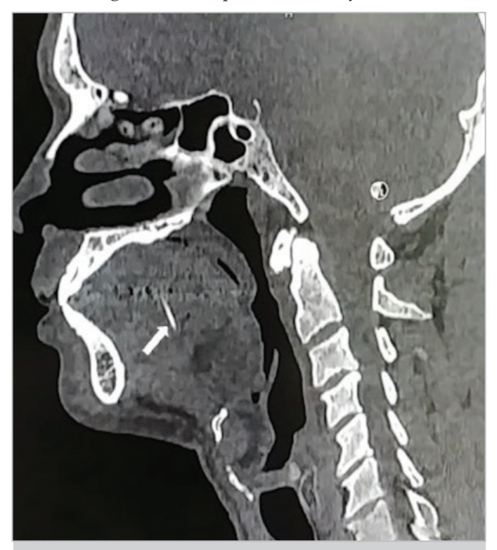
Figure 3. Sagittal computed tomography scan of the neck (first CT scan) showing a fishbone embedded in the tongue (white arrow) CT: Computed tomography

Case 2: A 41-year-old male presented with a two-week history of persistent odynophagia and dysphagia following fishbone ingestion. Before visiting our center, the patient had sought treatment at another hospital on the day of incidence. He had undergone EUA and tongue exploration twice via a dorsal midline incision, as a CT scan had shown a foreign body embedded in the tongue (Figure 3); but the fishbone could not be localized intraoperatively. The patient's symptoms improved and was sent home after three days of hospitalization with oral antibiotics. The patient presented to our center with a persistent pain on the left side of the tongue for one week following his discharge. Oral examination revealed edema at the FOM and the left base of the tongue. No fishbone or sloughy mucosa was found. Repeat neck CT scan revealed a dense tubular structure in the left hyoglossus muscle measuring 1.7 cm (Figures 4a and 4b). Initially, the fishbone could not be localized during transoral FOM exploration under general anesthesia. Intraoperative ultrasound was then employed, and the foreign body was identified approximately 1.4 cm anterior to the submandibular gland (Figure 5). The transoral approach was then converted to a transcervical approach. The left submandibular space was explored until the fishbone was finally located in the mylohyoid muscle and subsequently removed (Figure 6). Postoperative recovery was uneventful