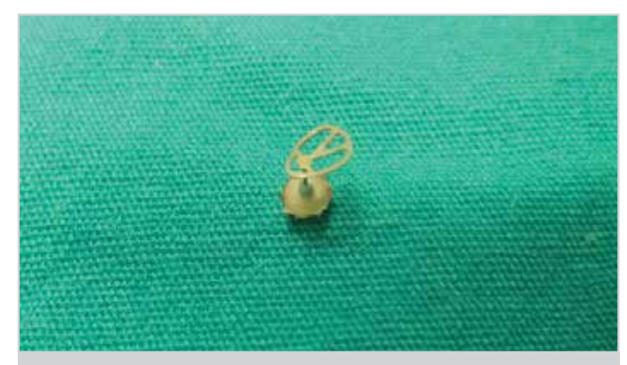
Figure 3. Position of TORP with the cartilage shoe on the basis and the insertion of cartilage graft on it

12^{\text{th}} month when the study was completed, it was determined that there were statistically significant differences in mean AC threshold values at 500, 1000, and 2000 Hz between Groups 1 and 2 (p<0.01), and the difference at 4000 Hz was also statistically significant (p<0.05) (Figure 5).