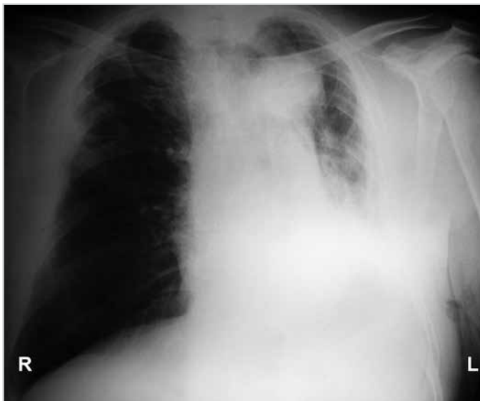
Figure 1. Chest X-ray showing hyperinflation of the right lung with complete collapse of the left lung and deviation of the trachea to the left

patient was not aware of the situation until he was asked about it. Chest X-rays did not reveal an overt foreign body but showed hyperinflation of the right lung with complete collapse of the left lung and deviation of the trachea to the left (Figure 1). Anticipating that the patient aspirated his TEPP, he underwent flexible bronchoscopy by a thoracic surgeon. The Blom–Singer prosthesis (Inhealth Technologies; Carpinteria, CA, USA) was identified in the left main bronchus and removed with forceps through the use of an instrument port. Although there was a significant improvement in the chest X-ray after the procedure (Figure 2), respiratory distress of the patient did not improve as much as we expected. This time, we noticed a hypodense area in the upper lobe of the right lung that was not clearly observed by any of us in the first chest X-ray (Figure 2). Next, computerized tomography (CT) scan of the chest revealed 6 cm mass in the upper lobe of the right