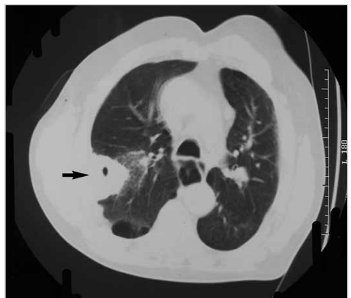
Figure 3. CT scan of the chest. Arrow indicates a mass in the upper lobe of right the lung with a hypodense necrotized center

The placement of voice prosthesis through TEP in a laryngectomy patient was first introduced by Singer and Blom (3) in 1980 and has evolved as the most common technique of choice for the restoration of voice after total laryngectomy. TEPP has to be regularly replaced, and the lifetime of the prosthesis is around 5 months (1, 4). Spontaneous loss of prosthesis occurs at a rate of 1% (1, 4).