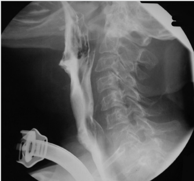
Figure 3. Postoperative barium esophagography showing a functioning neopharynx

Fistula was observed in 11 patients (47.8%). Six of these patients had laryngeal tumors, three had hypopharyngeal tumors, and two had esophagus upper segment-located tumors. All the fistulas were observed in the anastomose region between the upper side of the flap and tongue base. In all patients, the fistula was closed with conservative methods without the need of an additional surgical operation within nearly four weeks.