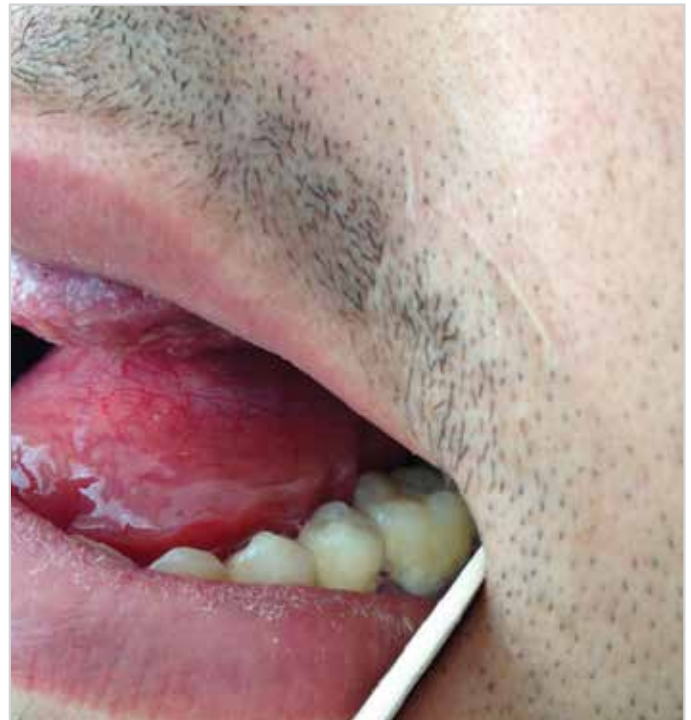
Figure 1. Appearance of the ranula in oral examination

Depending on the location, many lesions should be considered in the differential diagnosis. Diseases, such as branchial cleft cysts, dermoid cysts, abscesses, cystic hygroma, laryngocele, lymphadenopathy, thyroglossal duct cyst, and salivary gland