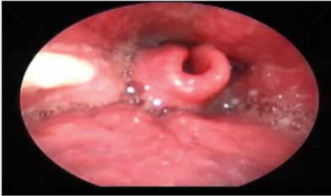
Figure 1. Fiberoptic appearance of the infected epiglottis