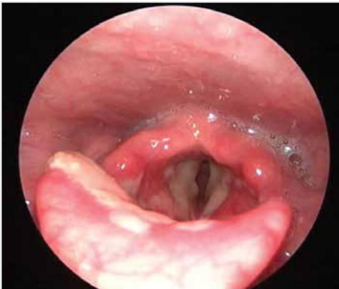
Figure 3. Fiberoptic appearance of epiglottic chemical injury after organophosphate ingestion

A patient with an epiglottic abscess underwent an immediate tracheotomy, and the abscess was drained at the same time.