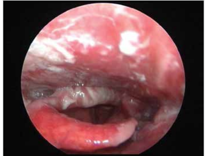
Figure 4. Fiberoptic appearance of epiglottic thermal burn in an adult following hot water aspiration

Endotracheal intubation was not performed for epiglottitis following thermal and caustic injuries, but one of two patients with epiglottitis due to angioedema required intubation. No prominent respiratory distress was observed in patients with Behçet's