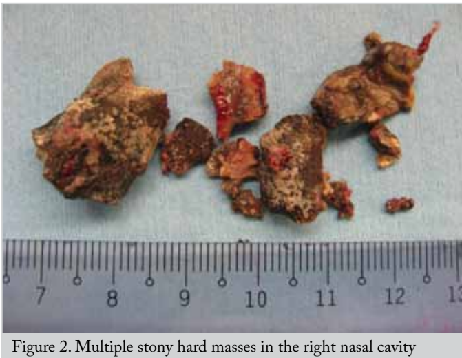
Figure 2. Multiple stony hard masses in the right nasal cavity

He underwent an examination under general anesthesia. Intraoperatively, there were multiple stony hard masses in the right nasal cavity (Figure 2). Upon removal of the rhinolith, the area became widened. The post-operative recovery was uneventful.