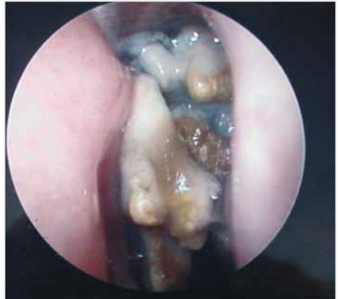
Figure 3. Irregular hard mass and friable mucosa at the inferior meatus

Rhinolith obtained its term from a Greek word, in which rhino = nose and lith = stone (6). It was first coined in 1845 and was