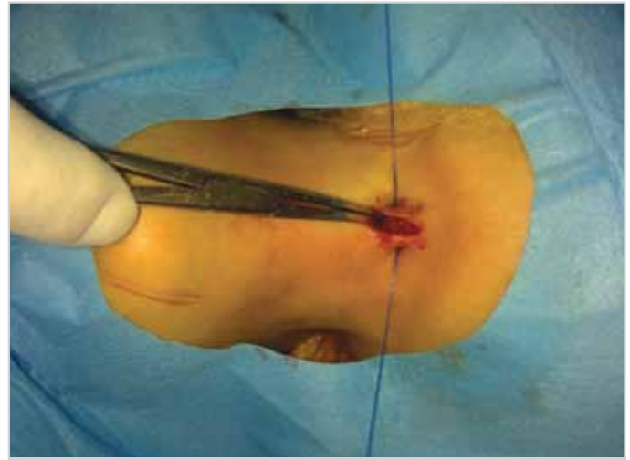
Figure 3. A patent tracheotomy was formed