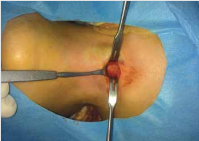
Figure 1. After incision and deep dissection thyroidal isthmus was retracted and tracheal rings were identified