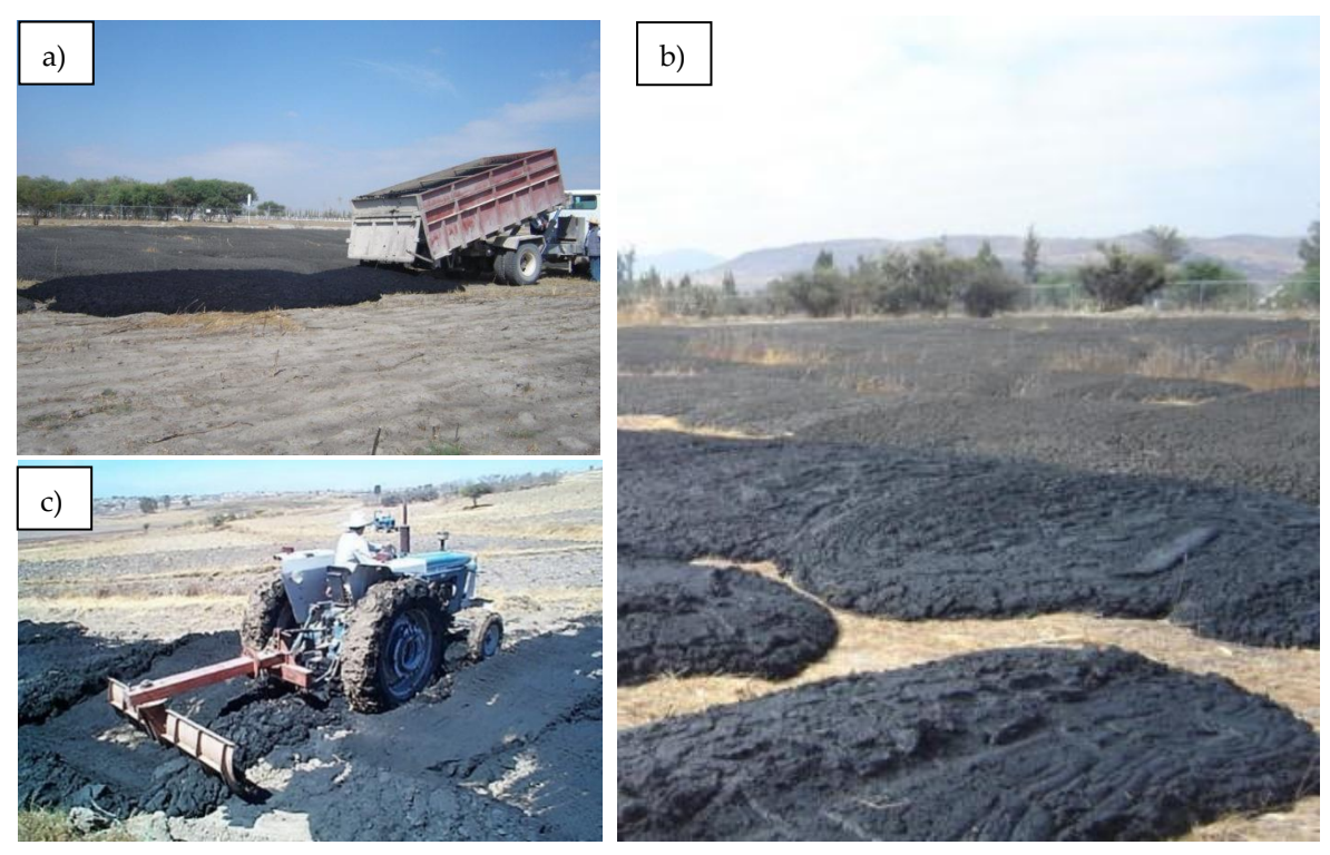
Fig. 2 a) Biosolids application into the soils, b) Dry of biosolids in the field, c) Incorporation of biosolids into the soil

Organic matter content was determined by the Walkley Black method; 10 mL of potassium dichromate (1 N) and 20 mL of concentrated sulfuric acid were added to 0.5 g of sieved soil. After 30 minutes, 200 mL of water and 5 mL of phosphoric acid were