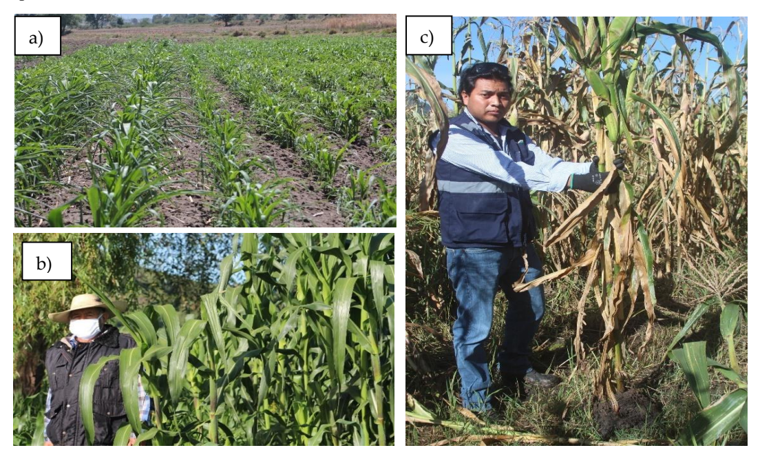
Fig. 3 a) Plants of corn in the initial stage of growth in soils with biosolids, b) Plants of corn in the final stage of growth, c) Maize plant sampling

Leal et al. 2021). In the same way, the high content of organic matter, nitrogen, and phosphorus make its agricultural application as an organic amendment or fertilizer a priority objective, within the concept of sustainable and ecological management of these materials. Figs 3 and 4 show an example of the obtained plants; it was evident that plants grown in soils with biosolids grew taller than those without biosolids.