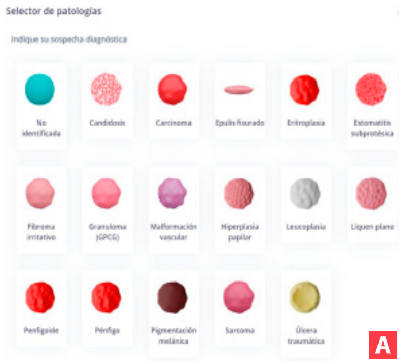
Figure 1. Intraoral examination section interface (Soft tissues and mucosa).