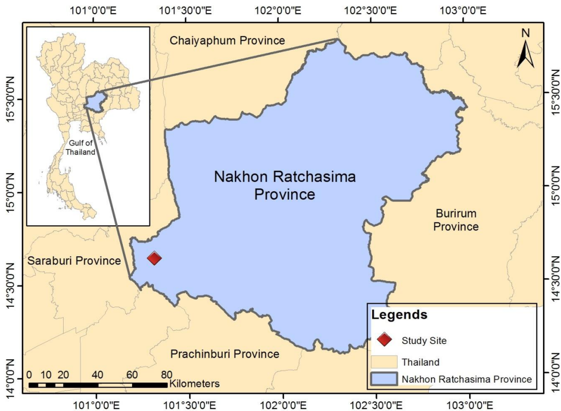
Figure 1 Experimental study site.

was collected from the wastewater treatment plant of Phuket Municipality. The samples of MSWIFA and SS were air-dried, ground and sieved through a stainless steel 2-mm sieve and characterized before use as soil amendments. The physicochemical characteristics of the amendments and the soil were determined, including pH (1:1 and 1:2 for soil to water ratio, and amendments to water ratio, respectively) [10], electrical conductivity (EC), organic matter content (%OM) by the Walkley-Black procedure [11], cation exchange capacity (CEC), exchangeable potassium (exc.-K) using 1 N NH 4 OAc extraction (pH 7), total nitrogen (total-N) by the Kjeldahl procedure, available phosphorus (avail.-P) by Bray II method, soil texture analysis using the pipette method and metal analysis according to the USEPA method 3052 protocol [12].