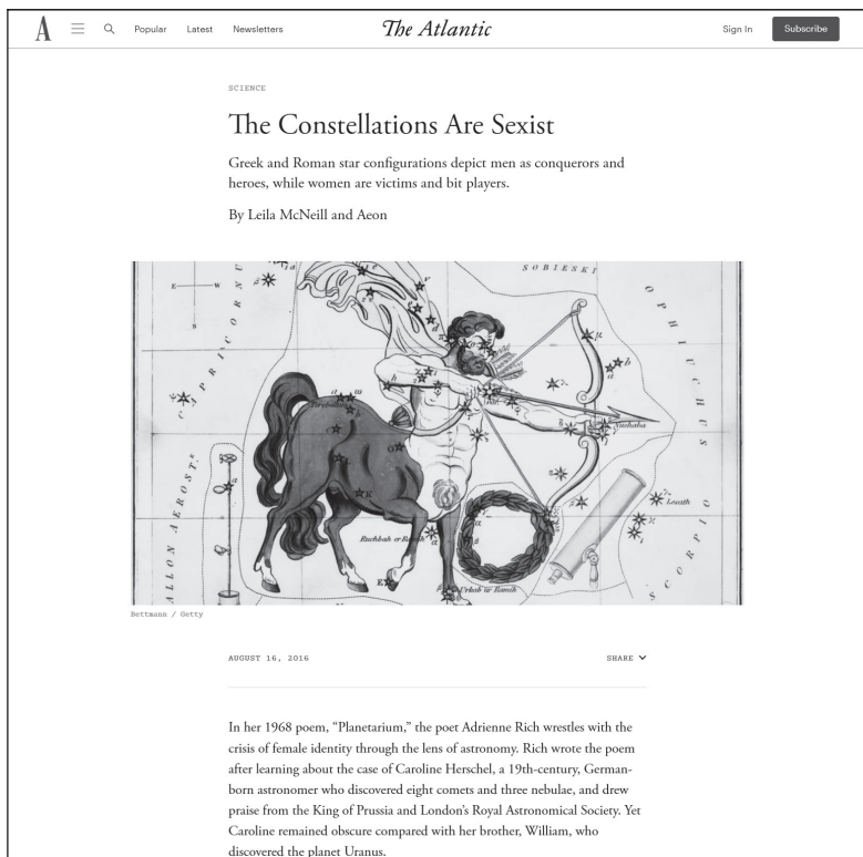
Fig. 3. Article from the Atlantic