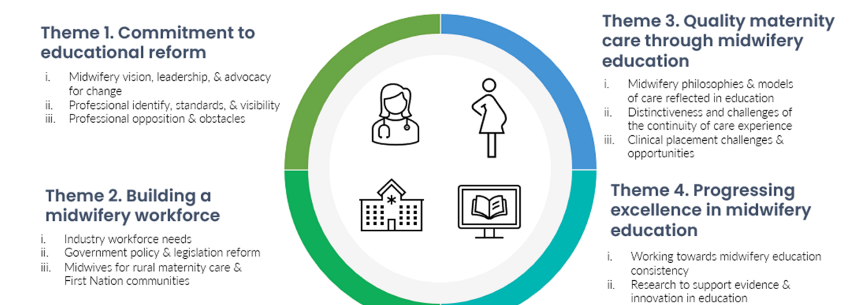
Fig. 2. Themes and sub-themes.

Key to abbreviations: PR-Primary Research, SR Secondary research, FGD Focus Group Discussion