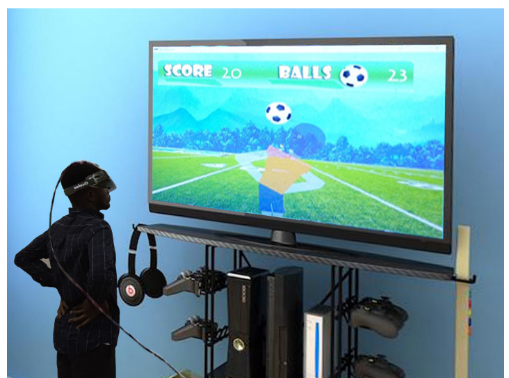
Figure 2. A participant in the Back Extension-Virtual Reality Game group