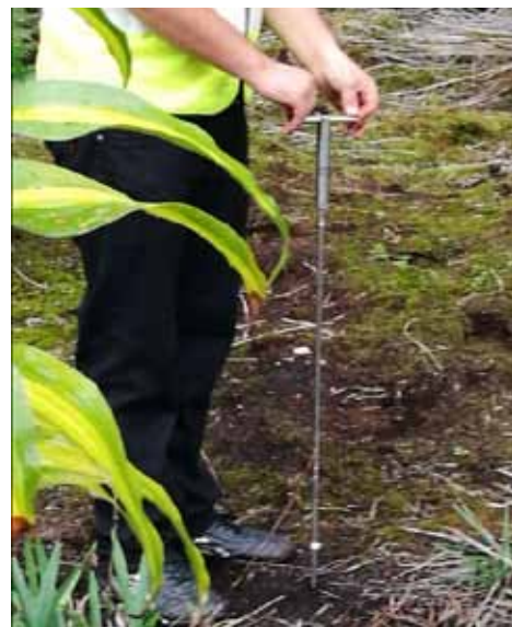
Figure 2: In-situ measurement of shear strength by using field vane shear apparatus.