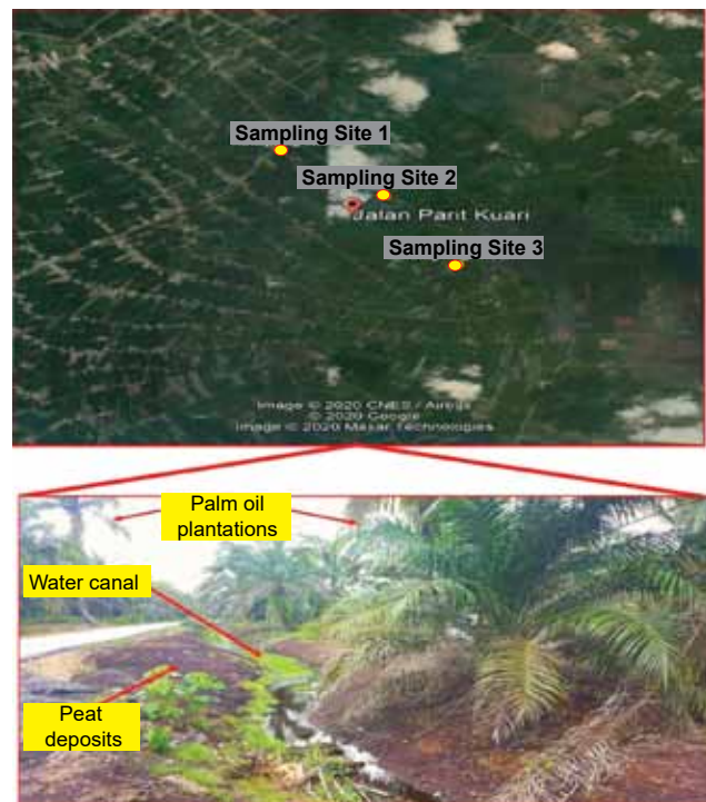
Figure 1: The sampling location sites.

The physical and mechanical properties were observed for both untreated and treated peat soil where the physical parameters including shear strength, moisture content and liquid limit and mechanical properties such as shear wave velocity were examined as tabulated in Table 3.