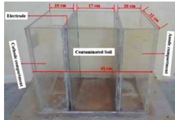
Figure 3: The EK cell for peat soil stabilization.

The moisture content was observed to be reduced in both phases due to the ion's movement towards electrodes.