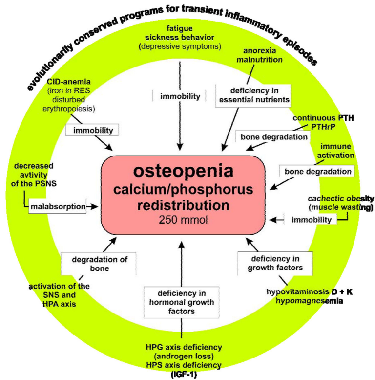
Figure 2. Disease sequelae of inflammation leading to osteopenia. The number in the pink middle area of 250 mmol represents the accessible amount of calcium provided from the bone (27). Abbreviations: CID-anemia; inflammation-related anemia of chronic inflammatory diseases; HPG axis, hypothalamic-pituitary-gonadal axis; HPA axis; hypothalamic-pituitary-adrenal axis; HPS axis, hypothalamic-pituitary-somatic axis (growth hormone, IGF-1); IGF-1, insulin-like growth factor 1; PSNS, parasympathetic nervous system; PTH, parathyroid hormone; PTHrP, PTH-related peptide; RES, reticuloendothelial system; SNS, sympathetic nervous system.