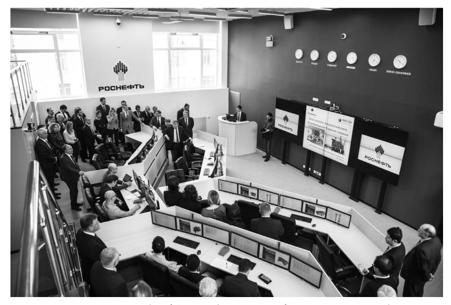
Fig. 1. Experimental and Research Centers and Engineering Complexes

ness". Universities grow into business enterprises, producers of commercial products, that is, of their intellectual property – know-hows, concepts, new material prototypes, artificial intelligence components, etc.