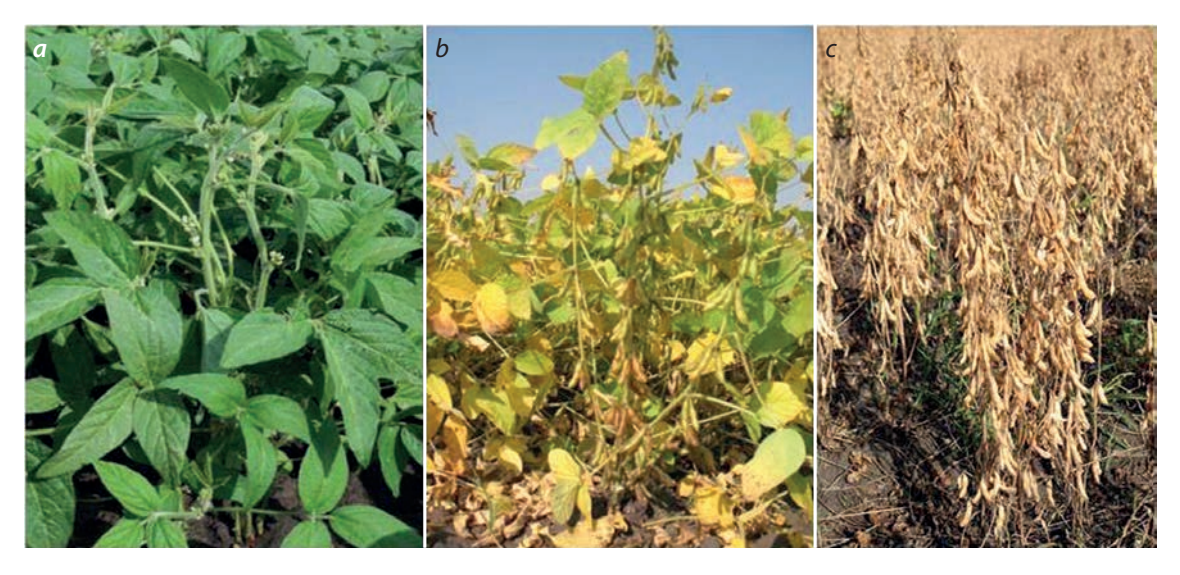
Fig. 2. A soybean variety of the determinate type from FSC LGC in different phases of development: (a) budding; (b) ripening of beans; (c) harvesting period.

terms of amino acid composition, solubility, and digestibility; 17–25 % oil suitable for food, feed, and technical purposes; 20–30 % carbohydrate compounds, including 10–12 % soluble sugars; 5-6 % ash mineral macro- and microelements; 12 essential vitamins and a range of other nutrients.