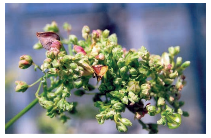
Fig. 3. Inflorescence of determinate green-flowered buckwheat with small flowers.

Varieties of many groat crops bred in Russia successfully compete in the world market of environmentally friendly products (Strahm et al., 2019). Russian varieties of millet and buckwheat, when tested in Switzerland, Austria, Germany, gave higher and more stable yields and higher groat quality