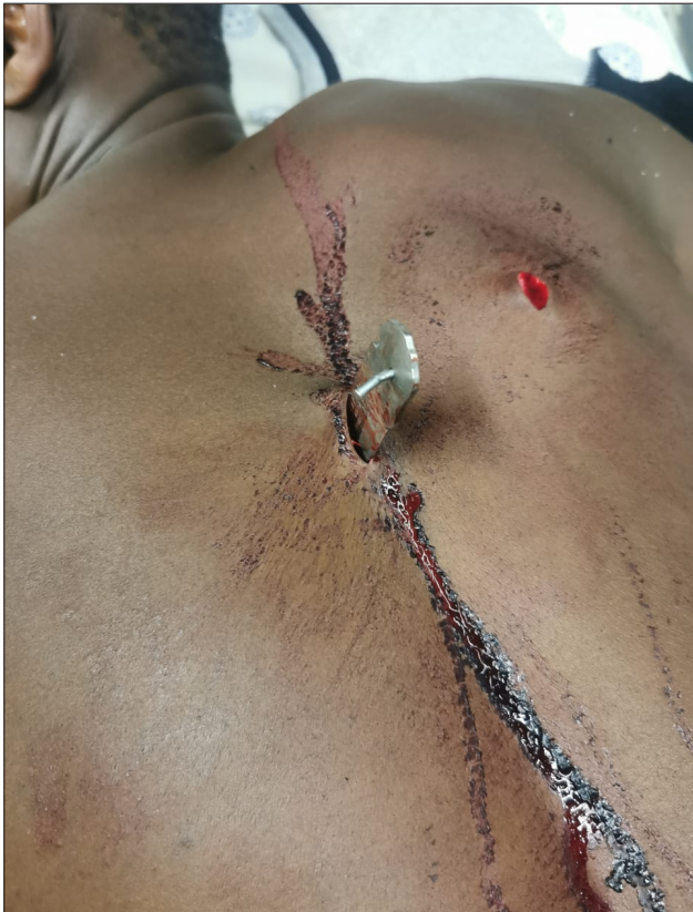
Fig. 2. Case 2. Penetrating back trauma with a knife blade still in situ.