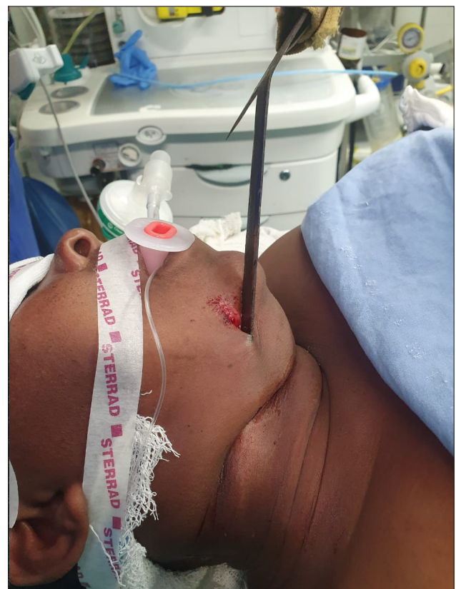
Fig. 1. Case 1. Penetrating neck trauma with a panga still in situ.

radiograph showed the tip of the blade to be in close proximity to the descending thoracic aorta (Fig. 3). An urgent CT scan with CTA indicated that the knife had penetrated in close proximity to the vertebrae and thoracic aorta (Fig. 4). Remarkably, the patient's condition remained stable. Emergency surgery was performed under general anaesthesia. Because of the radiological findings, the surgical team was alerted to the potential for major organ damage due to this penetrating injury. An orthopaedic surgeon assisted with the operation, while the specialised neurosurgical and vascular