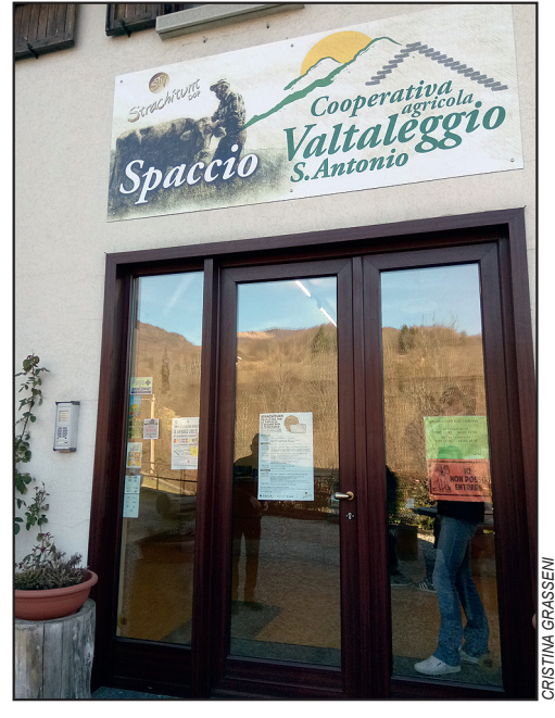
Figure 3: Cooperative shop displaying the Strachítunt conference program on the door.