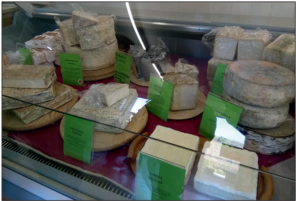
Figure 4: Cooperative shop selling several cheese made at the cooperatives including Strachítunt.