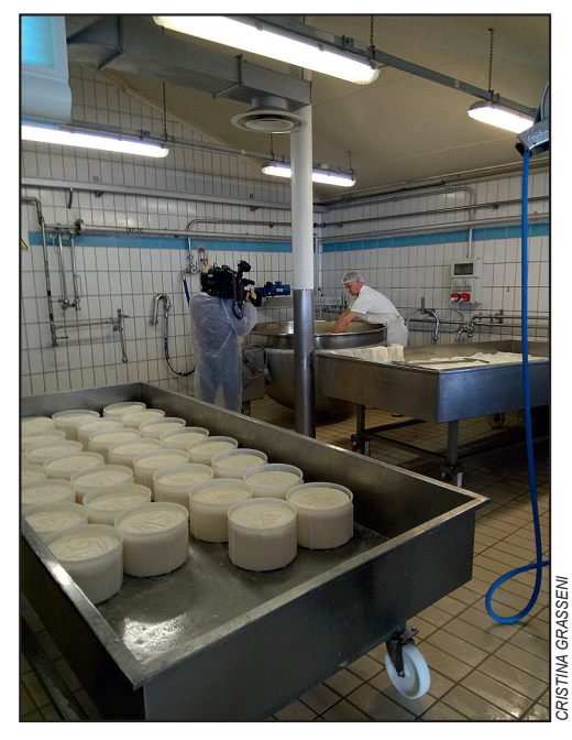
Figure 2: A cameraman records the curdling of the milk for Strachitunt production, Strachitunt wheels are in the foreground.

One of the take-away message provided by the representative of Assolatte (it. Associazione Italiana Lattiero-Casearia ), the industrial association of dairies (milk and cheese producers) was that consortia for geographic indications continue to play a key role for the Italian economy. Among the figures mentioned are the one indicated on the home page of the associations' official website (https://www.assolatte.it) with 16,2 billion euro turnover and over 100,000 jobs, the dairy sector is of paramount importance in Italy and abroad, exporting 40% of production for a value of almost 3 billion euro. A number of public institutions and professional associations dynamically participate in networks and alliances around the trade of cowbreeding and cheese-making, for example local administrations such as municipal councils and mayors,