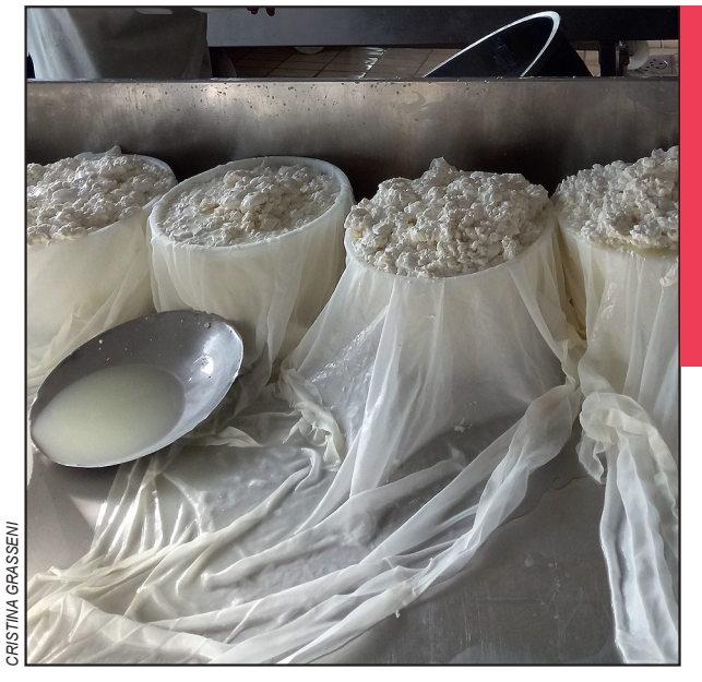
Curdling milk for Strachítunt production.