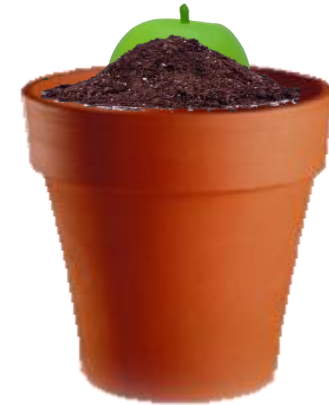
Lesson 3. Mystery pot