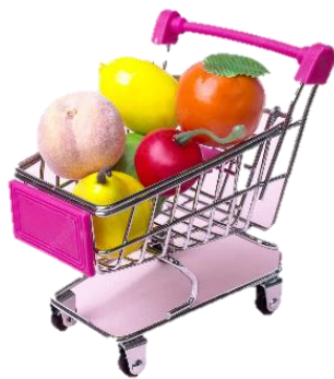
Lesson 5. Put it in the basket