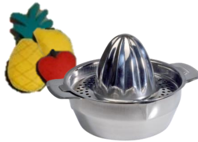
Lesson 2. "Squeeze the fruit"