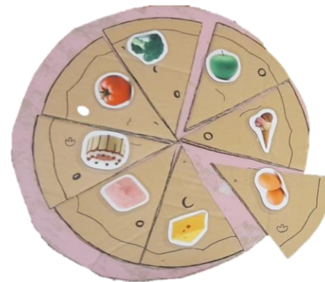
Lesson 3. Pizza