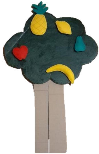
Lesson 1. Fruit tree