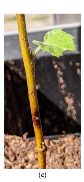
Figure 2. Fragaria × ananassa (Malling Centenary) 20 days post inoculation with Phytophthora cactorum isolates PhF17/19 (a) and PhF66 (b). (c) Betula pendula seedling six days post inoculation with P. cactorum isolate PhF66.