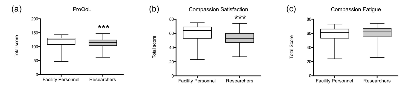
Figure 1. Animal-facility personnel versus researchers ( a ) professional quality of life scale (max 150), ( b ) compassion satisfaction (max 75) and ( c ) compassion fatigue (max 75) subscale scores. Data are presented as group median (min to max). *** p < 0.001.

We first compared ProQoL scores between animal-facility personnel and researchers. Facility personnel showed significantly higher total ProQoL scores than researchers (U = 19953; p < 0.001; r = 0.260; Figure 1a). The same results were obtained in the CS subscale (U = 15402; p < 0.001; r = 0.429; Figure 1b), but not in the CF subscale (U = 24581; p = 0.113; r = 0.088; Figure 1c).