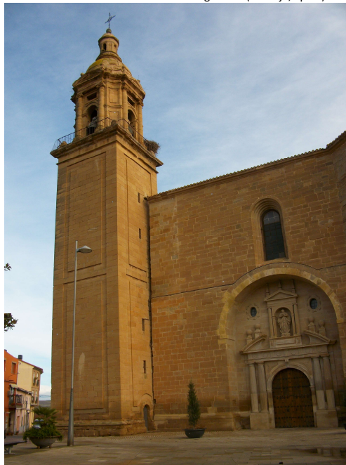
Figure 1. Leaning tower of Santa María la Blanca church in Agoncillo (La Rioja, Spain).

The appeal of leaning towers is noteworthy. Indeed, several successful experiences can be recalled in which the leaning itself has made a building an icon of the local or national heritage and a first class tourist attraction. Undeniably, towers are often the most impressive part of churches and, hence, of many of the towns and cities where they are located. As a result, the decay of a tower causes concern with safety as well as the expectation –somewhat malicious- of contemplating a building on the verge of collapsing with a loud din.