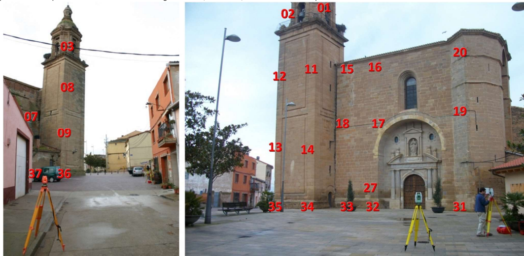
Figure 2. Open spaces around the tower from which the survey observations were carried out. The numbers on the pictures indicate the location and codes of the control points. Total station was arbitrarily set up by resection in eight positions at each epoch, the coordinates of the stationing points were auxiliary and valid only for that specific epoch since the points were not marked on the ground and, therefore, could not be reoccupied.

Individual movements between epochs were determined two-dimensionally (in the XY plane) since this approach greatly simplifies the computation. Nevertheless, the three-dimensional behaviour of the structure can be still inferred from the displacements of the group of targets placed at different heights in the same vertical line (such as locations 1, 11, 14 and 34). For instance, an increase of the leaning will create a coherent set of 2D vectors pointing at the same direction, the magnitude of each rising gradually the higher they are. In addition, should this increase happen, a similar pattern is to be expected in groups (2, 12, 13, 35) and (3, 8, 9, 36).