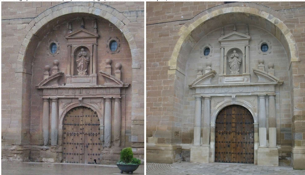
Figure 3. Photographs taken before (left) and after (right) the restoration of the façade, done at some moment between 2009 and 2014.

In order to be able to compare the coordinates obtained in different epochs it is necessary that all of them are computed by using the same reference system. Considering that in 2014, due to the loss of control points, it was no longer possible to use the reference system of previous computations, it was necessary to define a new one based on another pair of points that had been present during the whole observation period (from 2007 to 2014), in particular, points at locations