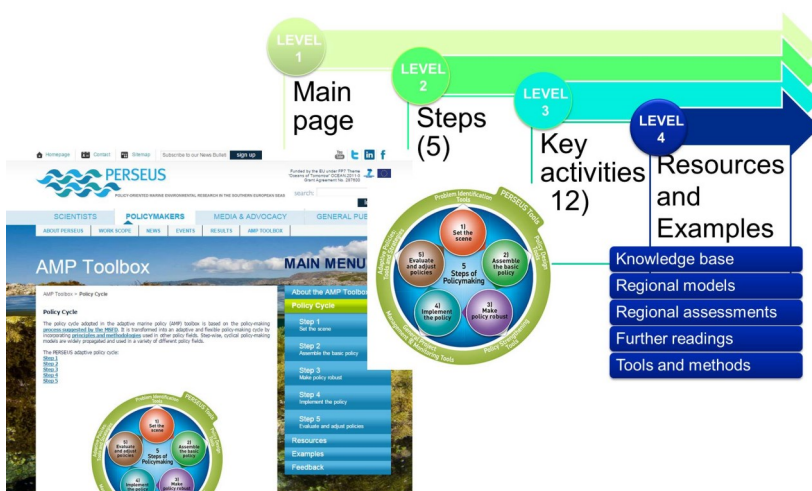
[Figure 2: Four-level structure of the Adaptive Marine Policy Toolbox ( http://www.perseus-net.eu/en/policy_cycle/index.html ).

Level 4-Resources and examples: The resources comprise: (i) the knowledge base, including 7 databases; (ii) different tools and methods; (iii) the regional assessments and models dedicated to the Mediterranean- and the Black Seas; and, (iv) further readings. Note that a given resource can be multifunctional or useful for different purposes, thus it can be linked to different activities and steps. The resources can be accessed through each activity, but also directly through the main menu (Figure 2).