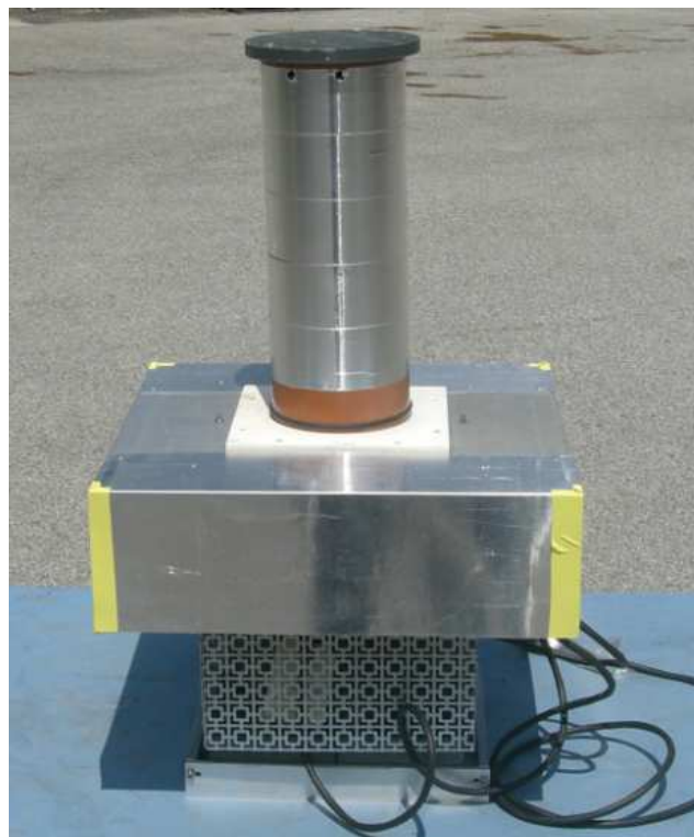
Fig. 1. A detector with shielding (see text) before being mounted on the tower.

All acquisition system is adapted in order to work in