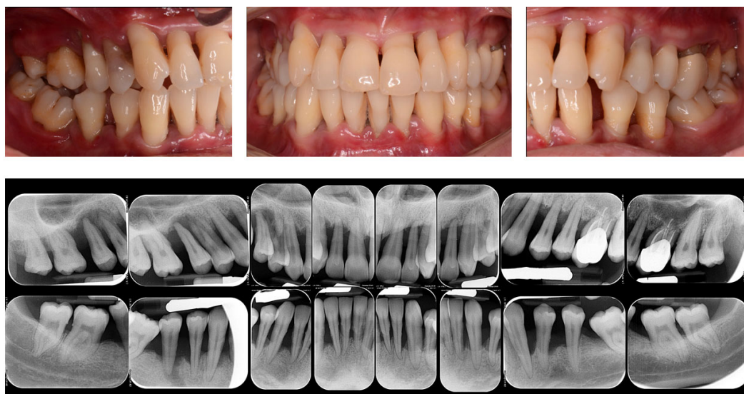
Figure 1. Clinical and Rx images of a patient with periodontitis.

It has been previously shown that the mechanical disruption of supra- and subgingival biofilm by the non-surgical periodontal therapy performed by SRP alone can reduce the plaque index (PI) and the bleeding on probing (BOP) in around 45% of periodontal sites [28]. On this regard, following non-surgical periodontal therapy, a reduction in the probing depth (PD) has been demonstrated in a range of 1.29 mm for periodontal pockets with an initial PD of 3–4 mm and of 2.2 mm for the pockets ranged 5–6 mm and an improvement in the clinical attachment level (CAL) in a range of 0.5–2 mm [29,30].