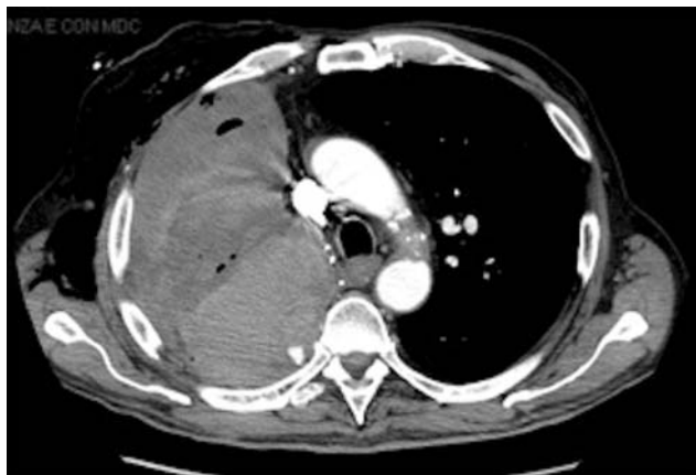
Figure 1: Chest CT performed for weakness, dyspnea and hemoglobin loss, shows the hemothorax due to the intercostal artery leakage. At discharge the thorax X-ray and the lab test did not show any acute bleeding sign.

an intercostal artery leakage (Fig. 1). A thoracic aorta angiography revealed an intercostal pseudo-aneurysm treated successfully with embolization (Fig. 2(A) and (B)). We performed a successful thoracoscopic debridement.