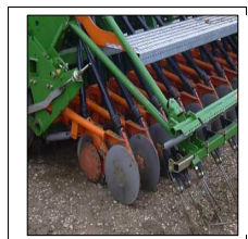
Figure 3. Lister discs in the Amazone