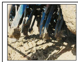
Figure 1. Hay-cutters in the Laseminasodo

characteristics of lister discs; being hay-cutters of lower weight, the pressure applied on the soil is insufficient to guarantee high depth, which we obtained with the Gaspardo and Amazone, thanks to lister discs and in the Gaspardo to the compliance of the adductor organs.