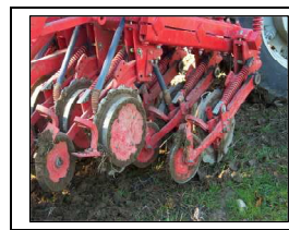
Figure 2. Lister discs in the Gaspardo