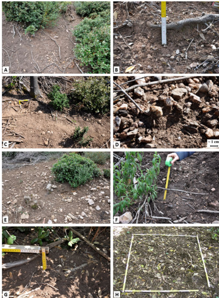
Figure 2. Examples of erosion and deposition features in the CWS stand (A–G) and forest floor at the undisturbed stand (H) at S'Isteri. Exposed roots (A–C), splash pedestals (D), exposed rock fragments (E), rill erosion (F), mound of soil material coming from upslope (G) and forest floor (H). [Colour figure can be viewed at wileyonlinelibrary.com ]

confined within the slope zone, not affecting downslope areas. No erosion or deposition features were detected in the undisturbed holm oak stand (Figure 2H). Moreover, the free survey in the CWS stand confirmed the very limited tree renewal by seedlings and the almost complete absence of organic horizons and highlighted the presence of 12% fallen Q. ilex trees and about 26% fallen I. aquifolium trees. Furthermore, the standing I. aquifolium trees were seriously damaged by the browsing and bark-stripping of local deer ( Cervus elaphus corsicanus ).