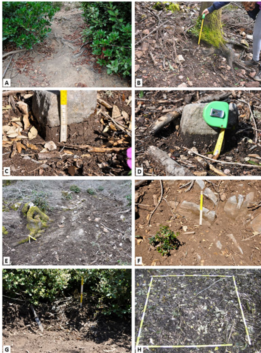
Figure 3. Examples of erosion and deposition features in the CWS stand (A–G) and forest floor at the undisturbed stand (H) at Su Caraviu. Exposed roots (A and B), isolated pedestals (C and D), rock outcrops (E and F), mound of soil material coming from upslope (G) and forest floor (H). [Colour figure can be viewed at wileyonlinelibrary.com ]

from January 1925 to April 2014 (Figure 4A). Among these, 19 days with rainfall \geq 100 mm were detected. From November 2011, start of coppicing in the studied areas, there were 15 days with rainfall \geq 50 mm, two of which with rainfall \geq 100 mm. At the Marganai station, in the period of time from January 2012 to April 2015, six dates with rainfall \geq 50 mm in 24 h were recorded (Figure 4B), while the dates with hourly rainfall \geq 10 mm amounted to 23 (Figure 4C).