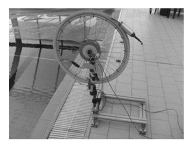
Figure 1. Ergometer device.

This device is basically composed by a 28" wheel (acting as a drum with a winding circumference of 2092 mm), a cable, two sensors (force and speed) and an electronic apparatus necessary to properly transmitted the data to a Personal Computer. The wheel is equipped with a disc brake (Shimano disc 160 mm diameter and Hayes Nine brake caliper) and a reflective encoder wheel with 72 pulses per turn read by an optical speed sensor (Optek OPB704). A 500 N miniature tension-compression load cell (F2220, Tecsis GmbH, Germany) was hosted inside an aluminum cylindrical (160 mm long, 47 mm diameter with a nose cone to minimize the hydrodynamic resistance effects) that act as waterproof case and was connected to the swimmer through a belt equipped with a system composed by a light aluminum bar and four twines. The load-cell signal is conditioned and powered by a Mecostrain 2038 module embedded in the cylindrical aluminum case.