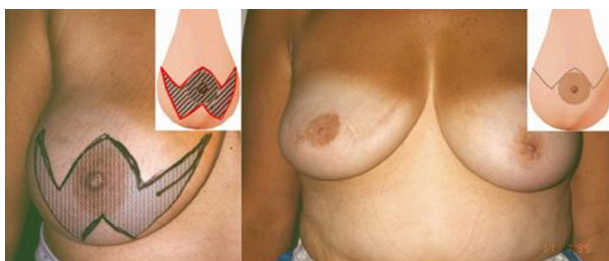
Figure 1 Batwing technique.