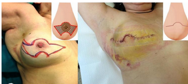
Figure 2 Modified batwing.