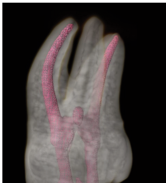
Figure 4. 3D rendering of a tooth obturated with Thermafil.

rates when filling the root canals with Soft-Core or lateral condensation. Another clinical study (20) did not find any difference in clinical outcomes between the lateral condensation and CBO technique performed with Thermafil obturator.