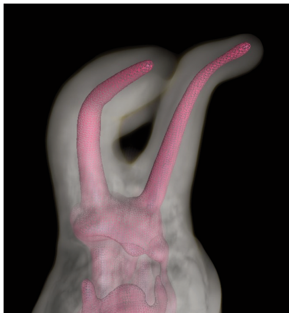
Figure 3. 3D rendering of a tooth obturated with Soft-Core.

There have been many studies comparing obturation methods in vitro showing the effectiveness and simplicity of CBO techniques (6-10, 15). The findings of the present study confirmed these positive results, with a minimal amount of voids and underfilling. De Moor and Hommez compared different obturation materials with a dye leakage study and found that there were no differences in the long-term sealing ability between Thermafil and Soft-Core (18). A prospective clinical study (19) found no difference in success