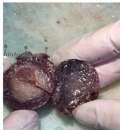
Figure 3: Macroscopic coronal sections of the horn pregnancy, directly communicating with fallopian tube.

The rarity and unusual presentation may contribute to a diagnostic delay, resulting frequently in an emergency intervention. If accurately diagnosed, the use of hormonal therapy followed by laparoscopic approach are the elective procedure to remove the rudimentary horn [19]. Based on this evidence, early identification of this condition decreases the long-term morbidity in terms of gynecologic and obstetric complications (i.e. primary dysmenorrhea, dyspareunia,