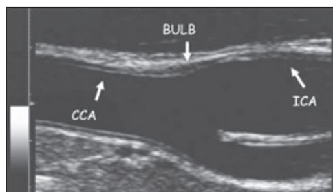
Figure 1 - Ultrasound imaging of right carotid artery and its segments: common carotid artery (CCA), carotid bulb (BULB), internal carotid artery (ICA).

bilaterally, after freezing the image on each occasion. IMT was defined as the distance between the inner echogenic line representing the intima-blood interface and the outer echogenic line representing the adventitia media junction. It was measured along the near and far wall of carotid artery. Furthermore, carotid bulb was defined as the point where the far wall deviated away from the parallel plane of the distal common carotid artery. Pathological IMT was defined as IMTm greater than 0.9 mm (40).