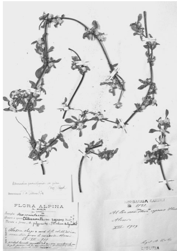
Figure 4. Alternanthera paronychioides A. St.-Hil.: exsiccatum from Alassio city (Liguria region) preserved at FI.

Alien status in Italy: Neophyte native to tropical and subtropical regions of America, Africa, Asia, and