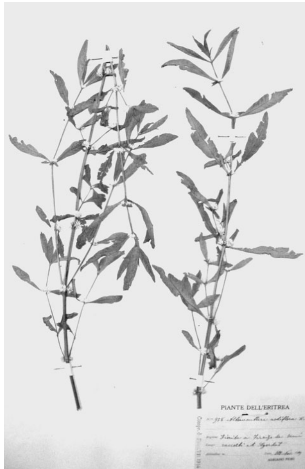
Figure 2. Alternanthera tenella Colla: exsiccatum from Florence city (Toscana region) preserved at FI.