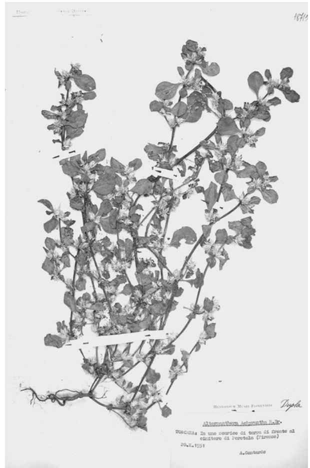
Figure 3. Alternanthera pungens Kunth: exsiccatum from Peretola locality (Toscana region) preserved at BI.

Elevation: 20–40 m a.s.l. [minimum altitude at locality Fegino (Liguria region), maximum altitude at Peretola (Tuscany region)].