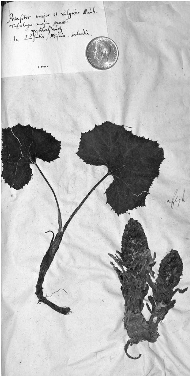
Fig. 2- Lectotype of the name Tussilago petasites L. (Herb. Burser, X: 150, UPS).