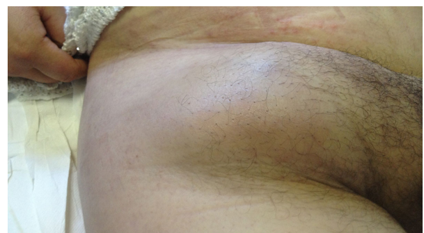
Figure 1 March 2014

In our case the Dabrafenib/Trametinib (antiBRAF/anti-MEK) combination leads to a fast clinical and radiological disease response with a good toxicity profile and a good management of AEs.