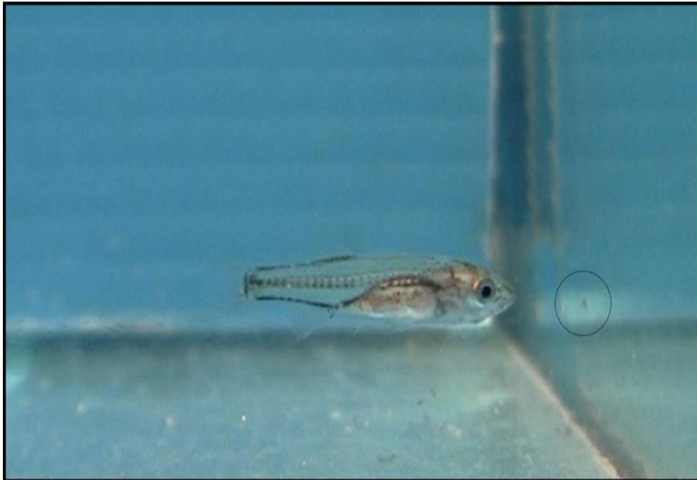
labrax L.) while searching for Artemia nauplii prey.

“experimental tank” remained constant for the whole duration of the experiment.