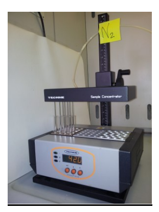
Figure 1. Sample concentration. Evaporation is increased by passing an inert gas (N_2) over the surface of the sample to remove the solvent. The gas travels through the gas chamber to the samples via the needles.