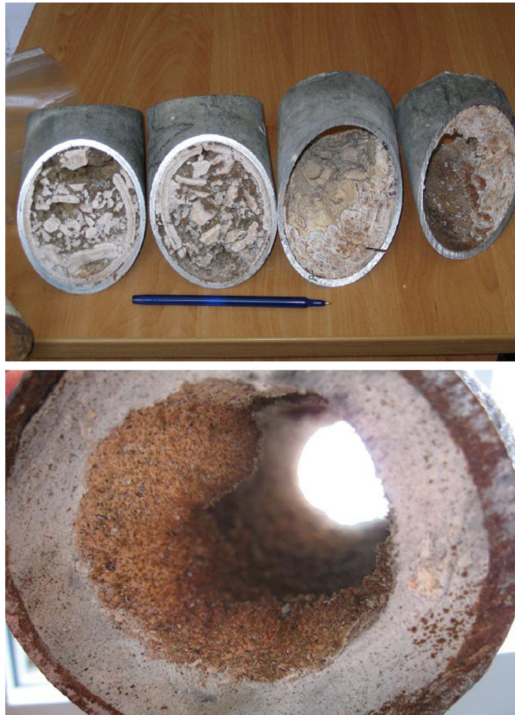
Figure 2 Inorganic deposits and biofilm in some of the water system tubes.