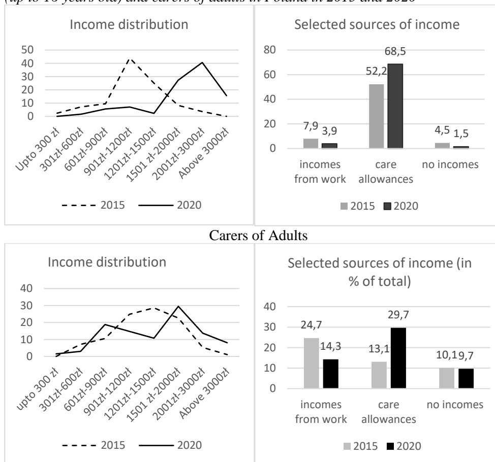
Figure 3. Income distribution and selected sources of income for carers of children (up to 16 years old) and carers of adults in Poland in 2015 and 2020