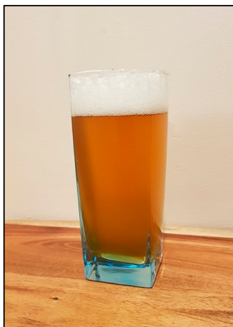
Figure 1. The photograph of the beer presented to participants.

demand characteristics that might be present if the MSIS was presented before assessing expectations regarding the beer. Participation took approximately 10 min.