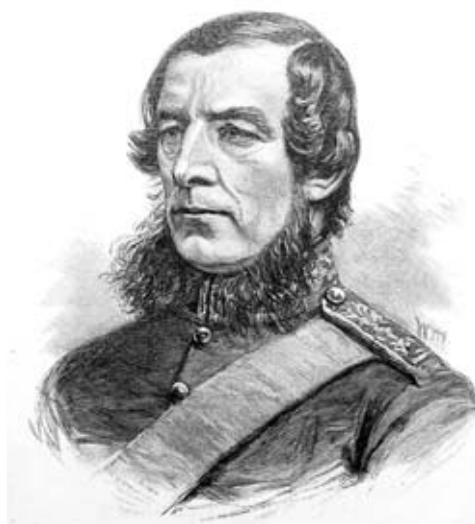
Henry Barkly, Governor of Victoria.

known throughout the empire as Australia Felix ('Happy Australia') for its immense natural beauty and abundance. 37 The first colonisers sought their riches from its fertile lands, while the first Victorians sought their riches in from its riverbeds and deep leads. 38 Within years of its creation the colony had achieved self-government and considerable independence from the Crown. 39 This section will consider a number of colonial Victorians who were beneficiaries of slavery. Of those mentioned, over half were people who held influential positions in society. Overall, Victorian beneficiaries varied considerably in terms of their power and influence, from a serial governor through to an Avoca farmer.