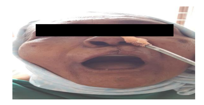
Figure 2: Post-operative right partial maxillectomy with obturator in situ.

Fifteen patients with Browns class I defect where upper bite resection was done as a part of composite resection for gingivobuccal cancers, for whom reconstruction was done with pectoralis major myocutaneous flap had good recovery in the post-operative period and their speech and eating function were restored eventually.