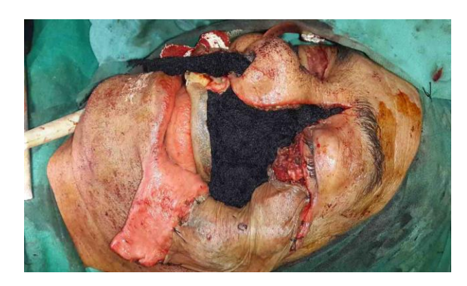
Figure 3: Carcinoma left maxilla following left total maxillectomy and obturator and split skin graft.

Ten patients with class 2a maxillectomy with split skin graft and obturator reconstruction had uneventful post-