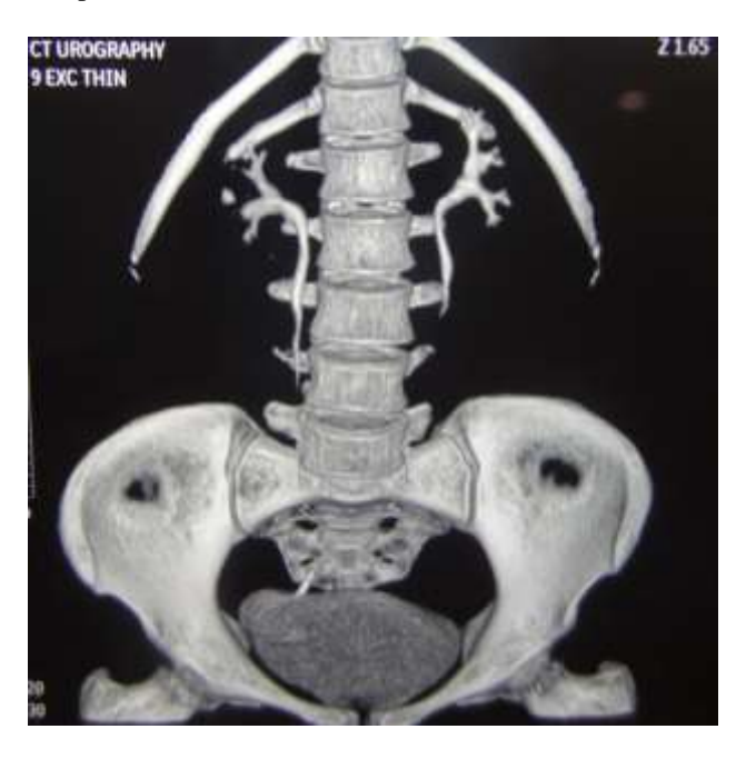
Figure 1: Computed Tomography image of the intrauterine contraceptive device embedded inside detrusor muscle of bladder.

showing CT image of the IUD embedded inside detrusor muscle. Figure 2 is showing graphical representation of IUD embedded inside detrusor muscle. After initial diagnosis both patients were treated by endoscopic removal of IUD via per urethral route. Figure 3 is showing cystoscopic view of IUD embedded into detrusor muscle. Nephroscope and assembly were introduced into bladder and with help of stone holding forceps IUD was removed intact. Both patients were discharged after 3-4 days of surgery and catheter was removed after 7 days and 14 days respectively. Injectable antibiotics were given for one day followed by oral antibiotics for 5 days. Lower abdomen pain and irritative symptoms subsides after removal of catheter. None of the patient developed vesico-uterine fistula or any other complications.