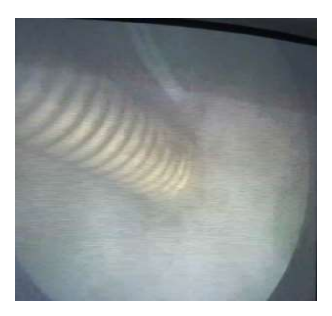
Figure: 3 Cystoscopic view of intrauterine contraceptive device embedded into detrusor muscle.