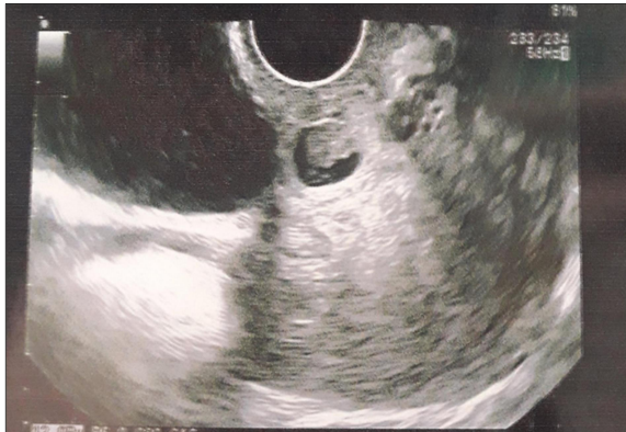
Figure 1: Ultrasound of caesarean scar pregnancy.

On investigation, routine blood and urine investigations were normal. Her urine pregnancy test was positive. Trans vaginal ultrasound revealed single well-defined gestational sac in uterus at the site of caesarean scar with poor choriodecidual reaction. Myometrial thickness between the sac and urinary bladder is 1.6 mm with possible adhesion between uterus and urinary bladder. Mild vascularity seen around gestational sac. Single embryo of 6 weeks 5 days seen, cardiac activity was not seen, adenexa normal Figure 1. A diagnosis of caesarean scar pregnancy was considered. Patient was given option for medical management with methotrexate or surgical management with laparotomy, she has undergone for laparotomy. Intraoperative findings were soft and vascular mass seen at the site of previous scar Figure 2. Incision was given over bulge and products of conception were gently removed. It was communicating with uterine cavity, edges of scar tissue were excised and freshened, gentle uterine curettage was done. Tissue was sent for histopathological examination and diagnosis of caesarean scar ectopic pregnancy was confirmed.