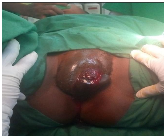
Figure 1: Post traumatic left vulvar hematoma (tense, painful and dehiscent).