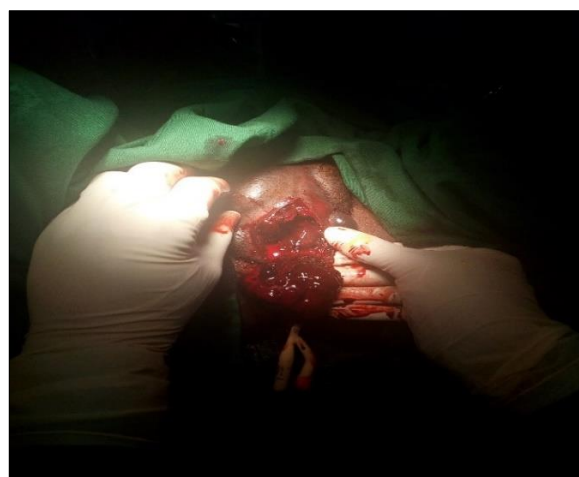
Figure 2: Evacuation of the hematoma unveiling bleeding vessels inside the bulbospongiosus muscle.

Her past surgical, gynaeco-obstetric and medical history was unremarkable. On admission, she was hemodynamically stable and afebrile. Pre-operative workup was unremarkable except for a mild anemia (Hemoglobin level: 9.4 grams/deciliter). Giving the obvious evolution of the hematoma, imaging exploration was not requested. Management was based on surgical evacuation, hemostasis control and primary closure under general anesthesia. Exploration revealed a superficial hematoma lying mainly in the sub-cutaneous fat of the left labia and the lower fourth of the mons pubis (Figure 1).