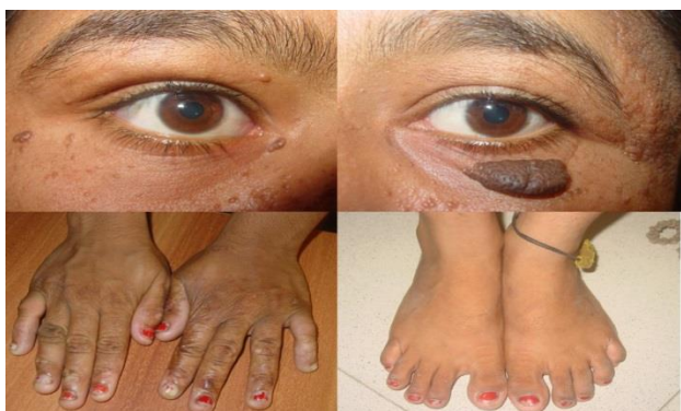
Figure 4: Retinal hamartoma within papillo-macular bundle.