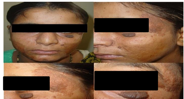
Figure 2: Cutis Vertis gyrate 15cm x 7 cm - extradural intradermal cerebriform lesion on both parieto-occipital region.