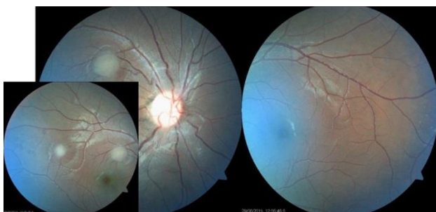
Figure 5: MRI brain showing subependymal giant cell astrocytomas, subependymal nodules and cortical tubers.