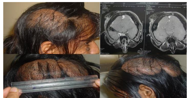
Figure 3: Normal anterior segment with absence of Koenen's tumours.