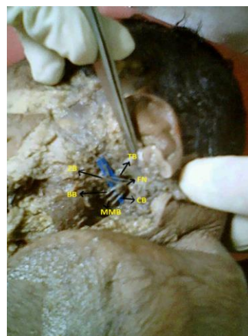
Figure 3: Foetal specimaen showing five terminal branches from the trunk.